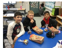
Terry Fox Prize Winners